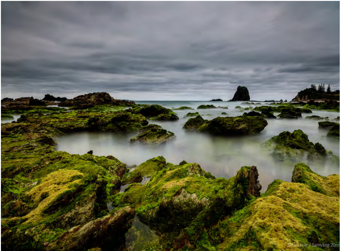
Seth Lazar / Samyang 20mm

The optics feature an Ultra Multi-Coating to guard against lens flare and ghosting for increased contrast and color neutrality when working in strong lighting conditions.