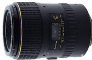
Canon Mount Model