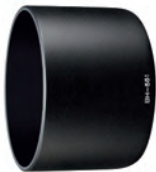
Lens Hood BH-551 The large BH-551 Macro hood with "click-lock" to stay in place.