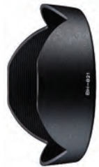
Lens Hood BH-821 The large BH-821 wide-angle hood with "click-lock" to stay in place.