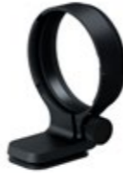
The tripod mount ring is ARCA-SWISS compatible and can be removed when required.