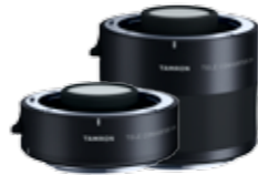
Two optional teleconverters available (1.4x and 2.0x)

** Using in VC MODE 3 For Canon: 5D-MKIII is used For Nikon: D810 is used