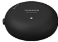
With the TAP-in Console you can update and customize your Tamron lens for your personal needs