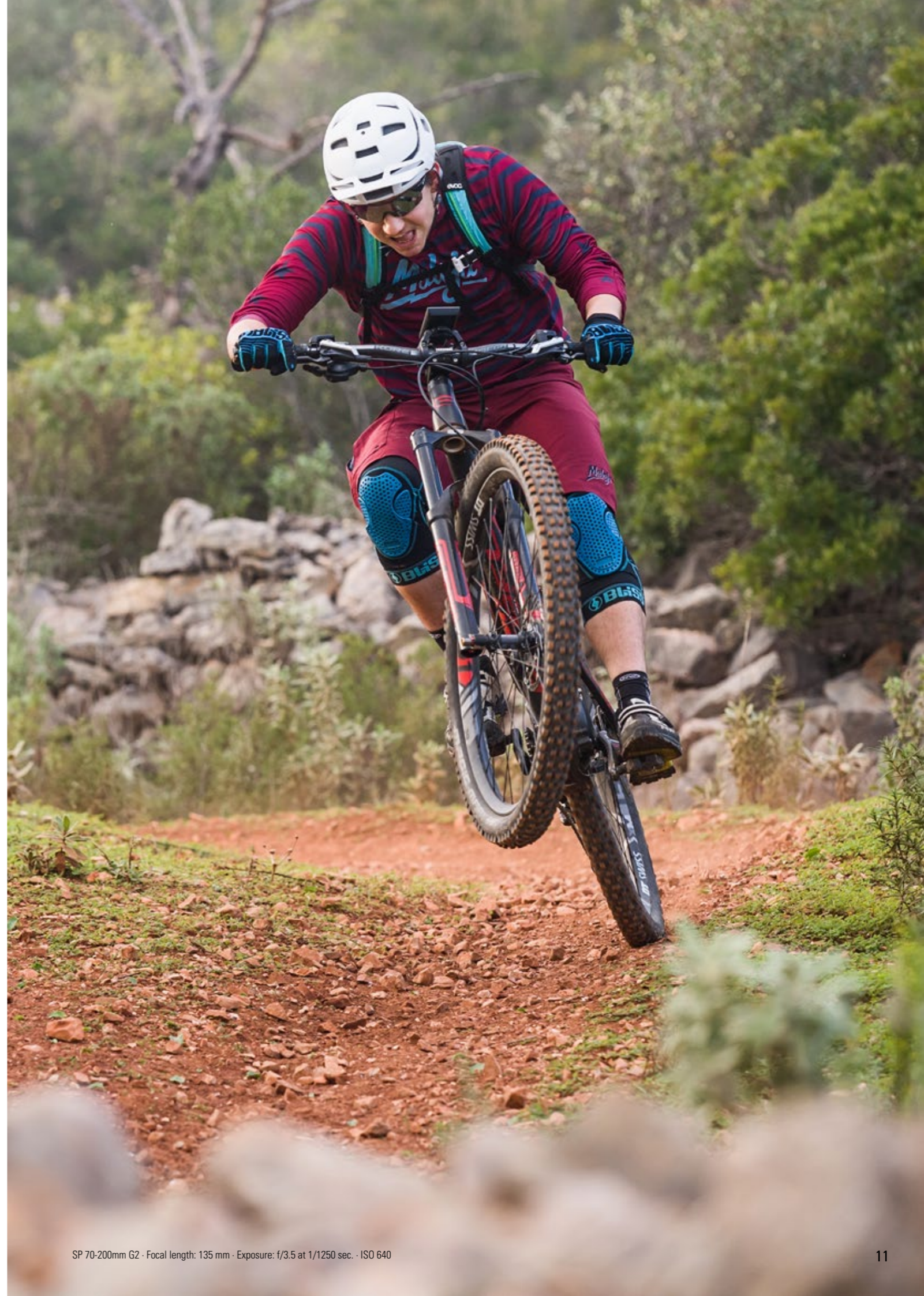
SP 70-200mm G2 - Focal length: 135 mm - Exposure: f/3.5 at 1/1250 sec. - ISO 640