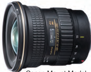
Canon Mount Model

Lens Hood BH-821 The large BH-77B wide-angle hood with "click-lock" to stay in place.