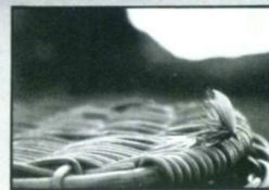
Macro focus at 1/4 life size